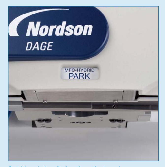
Cartridge window displays the active transducer or indicates that it is in 'Park Position'

Hybrid 20kg shear / 1kg pull and 10kg pull