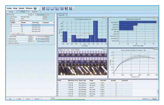
Customizable views for test data analysis